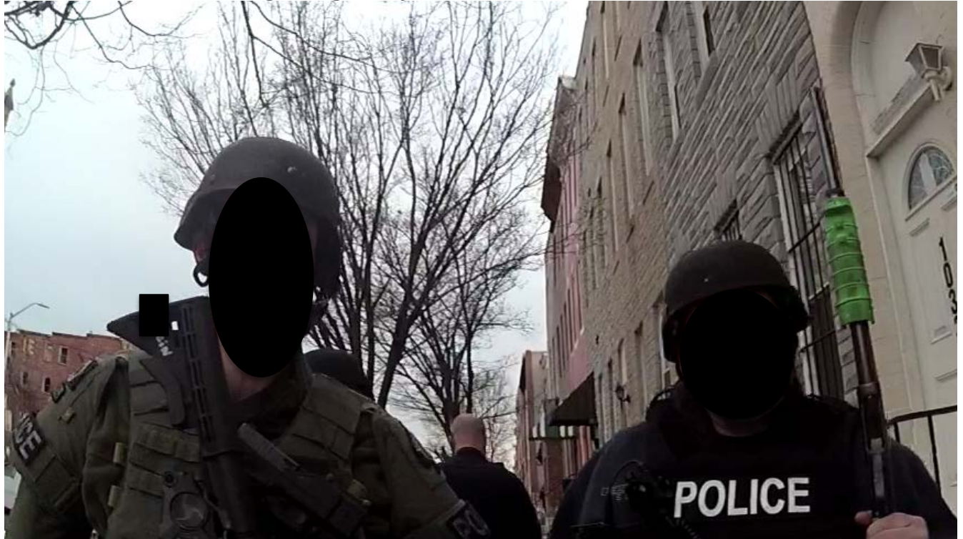
SWAT Team Members getting ready to enter the house